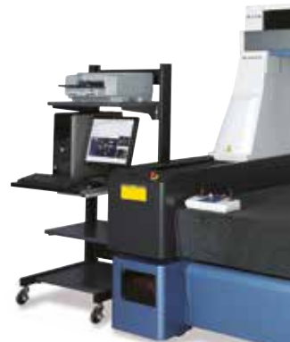
CRYSTA-Apex S 9106