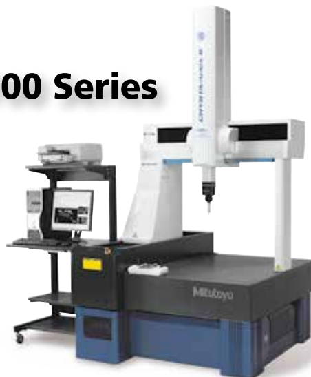
CRYSTA-Apex S 776