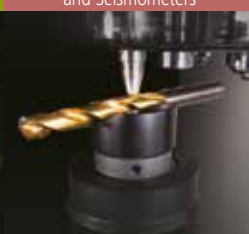
Test Equipment and Seismometers