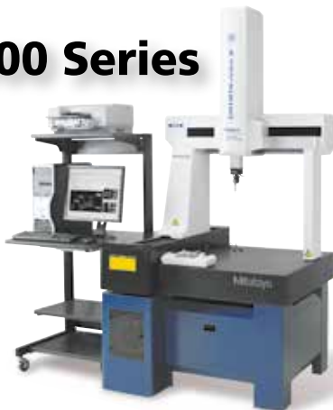
CRYSTA-Apex S 544