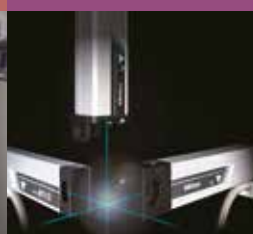
Digital Scale and DRO Systems